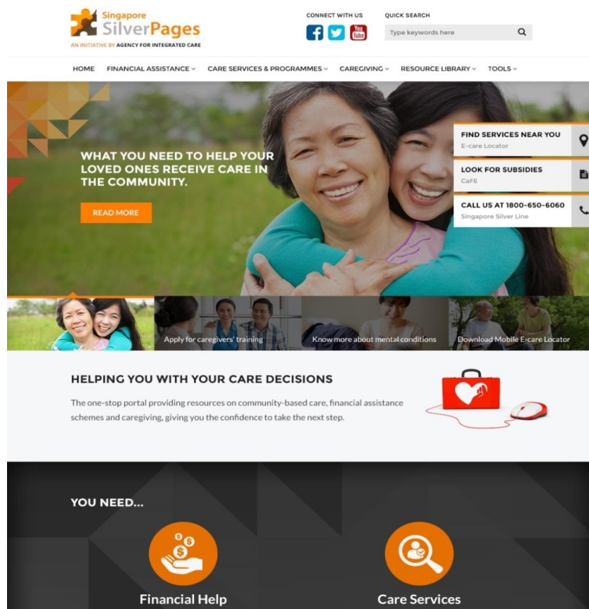
(Screen shot on part of enhanced SSP homepage)