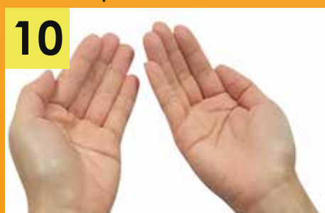
Your hands are now safe