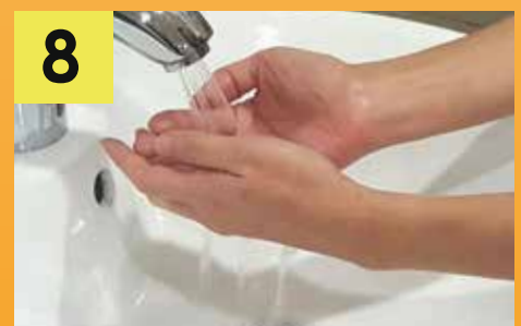
Rinse hands with water