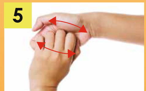
Backs of fingers to opposing palms with fingers interlocked