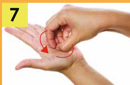
Rotational rubbing, backwards and forwards with clasped fingers of right hand in left palm and vice versa