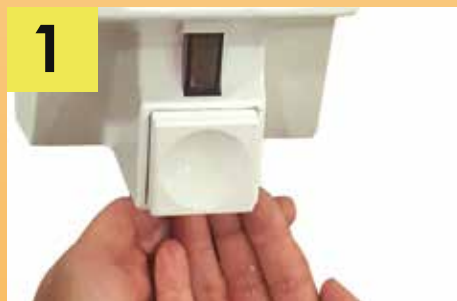
Apply enough soap to cover all hand surfaces