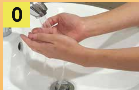
Wet hands with water