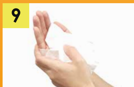
Dry hands thoroughly with a single use towel or hand dryer