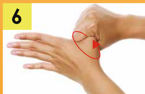
Rotational rubbing of left thumb clasped in right palm and vice versa