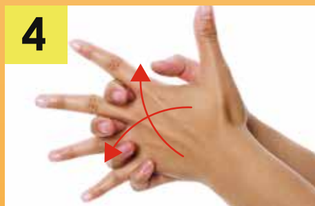
Palm to palm with fingers interlaced