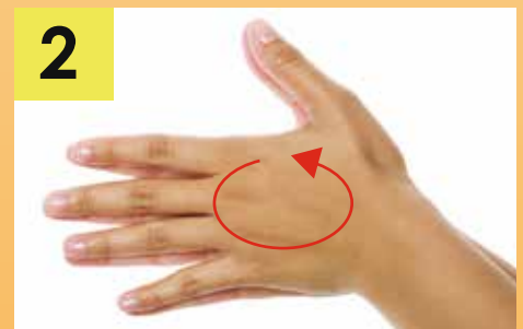
Rub hands palm to palm