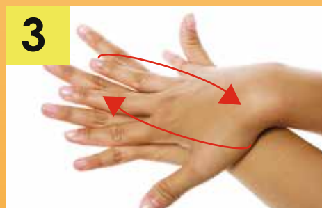
Right palm over left dorsum with interlaced fingers and vice versa